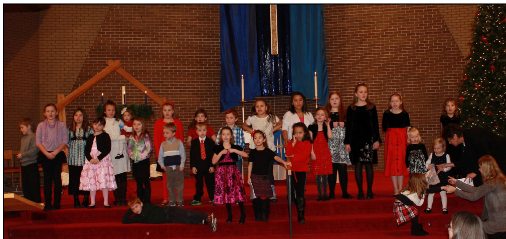
How cute are the kids at the Christmas program on December 15!

Look for more information on summer camp programs and dates, financial aid and fundraising in the February Herald!